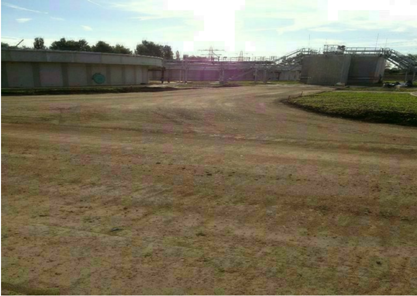
Un surfaced RoadCem bound soil base photographed after two years construction plant trafficking.