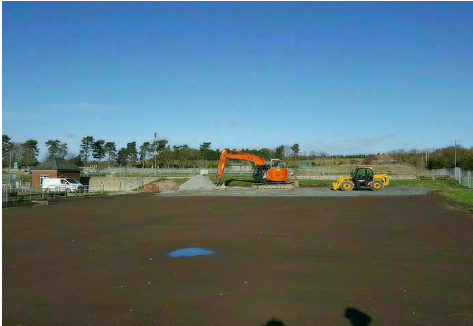
An impermeable operating slab for the washing of bio filter media.

Following on from previous works carried out with RoadCem soil concrete technology by our contractor DNS (Midlands) Ltd. The Severn Trent AMP 6 Alliance chose RoadCem for this project. After removing the turf layer the existing soils were mixed to a depth of 300mm with our patented RoadCem soil concrete process. To form a durable impermeable slab for the media washing plant.