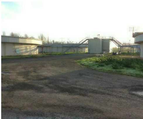
The same section as above seven years later in the early winter of 2020.

In the late Summer of 2015 with works completed our contractor DNS (Midlands) Ltd returned to site to; mill areas back to soil and converting other stabilised sections to car parks and permanent site roads.